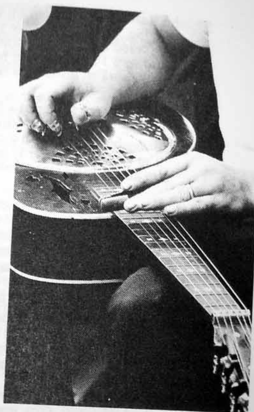
It's a dobro.